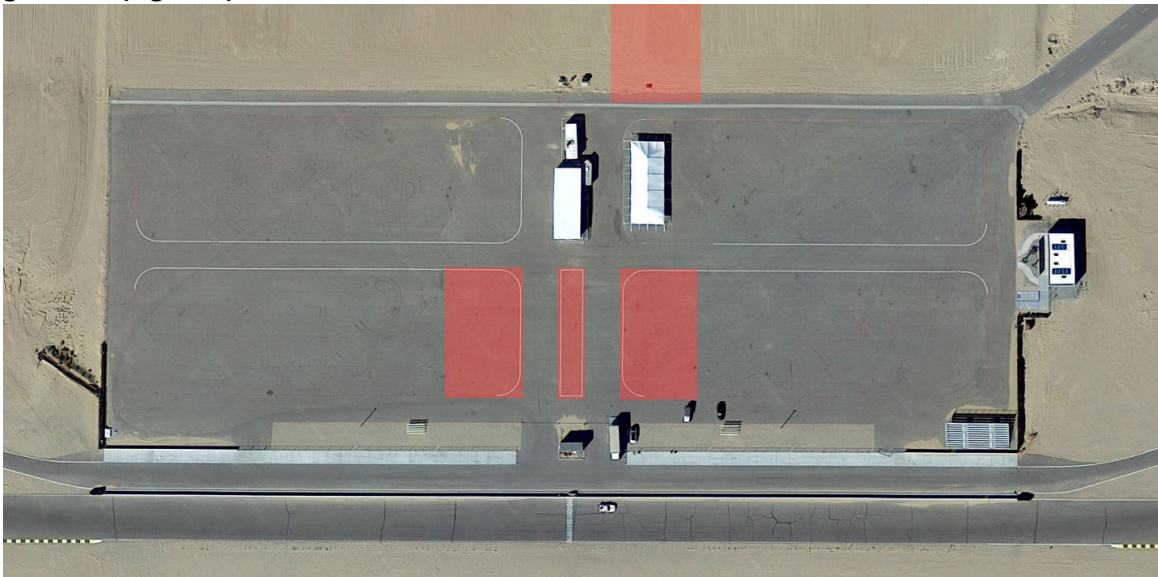
Figure 1: Chuckwalla Parking Guide

Please do not park in the reserved areas without approval from the event chair, marked in red on the image below (Figure 1):