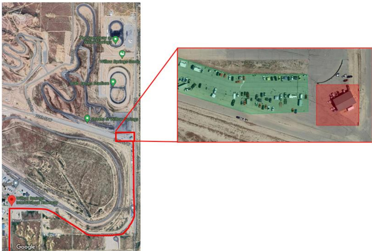
Figure 1: Streets of Willow Parking Guide

Streets of Willow is the second largest track at WSIR. From the main gate, follow the access road to the right, past the gas pumps, past the RV parking, around the outside of Big Willow turn 8 to the Streets of Willow paddock. Please do not park next to the old garage building, marked with the red square in the image below ( Figure 1 ), the green area is available for attendees: