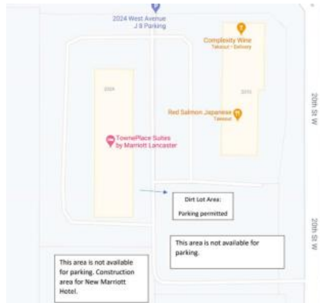
Figure 2: Hotel Parking Guide

If you trailer your car, you will likely find it better to drop off the trailer at the track the afternoon before. The hotel parking lot is tight. There was a small dirt lot by the hotel that trailers could be parked in last year ( Figure 2 ).